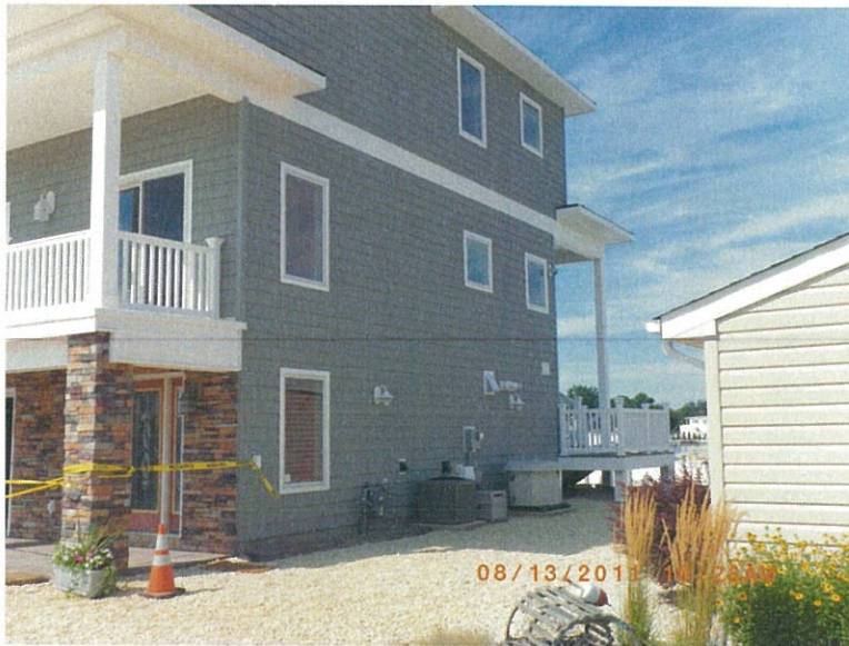
"Right Side View"