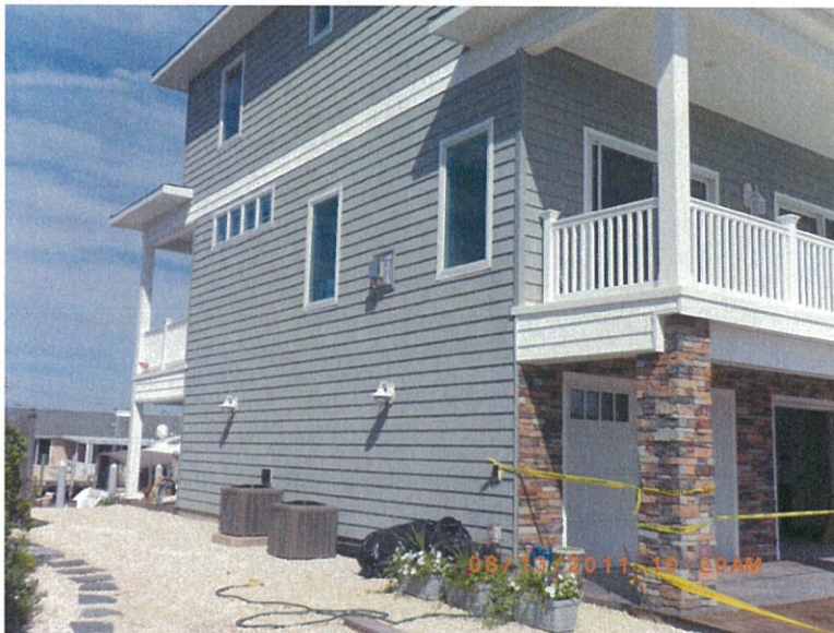
"Left Side View"